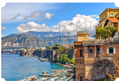
Sorrento, Italy Coastline