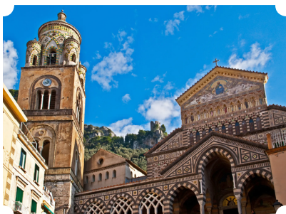
Cathedral of Amalfi