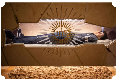
Blessed Carlo Acutis