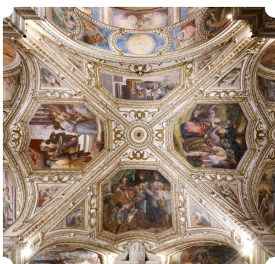
Ceiling Interior of Cathedral of Amalfi