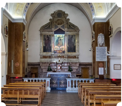
Original church in SGR where Padre Pio celebrated his Masses

Upon attempting to shoot the beast with an arrow, the arrow mysteriously turned back on the man and hit him in the foot. Being frightened, the landowner went to the Bishop who prayed and did penance to discern what exactly was the cause of this event. Saint Michael appeared and told him that this land was sacred ground and that this man had offended him. He said: "I am the Archangel Michael and am always in the presence of God. The cave is sacred for me, I have chosen it. I, myself, am its' watchful custodian. There, where the rock opens wide, the sins of men can be forgiven. What is asked for here in prayer will be granted. Therefore, go to the mountain and dedicate the grotto to the Christian religion."