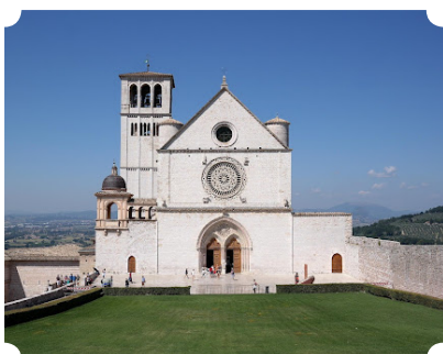
Papal Basilica and Sacred Covent of Saint Francis in Assisi