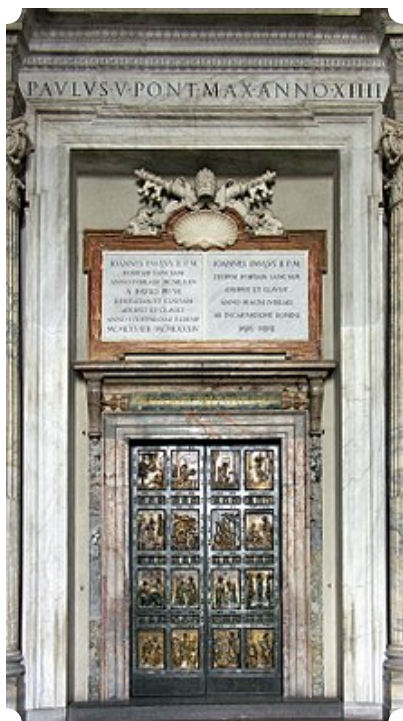
The Holy Doors at Saint Peter's Basilica