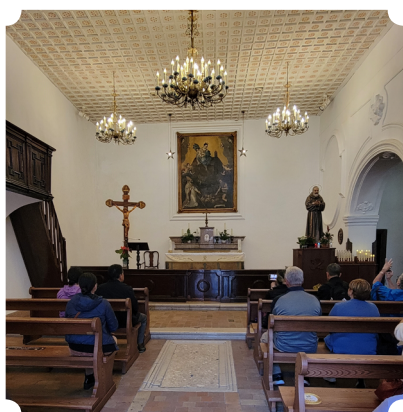
Our Padre Pio Foundation of America pilgrims praying inside Santa Anna Church in Pietrelcina, where Padre Pio was baptized.