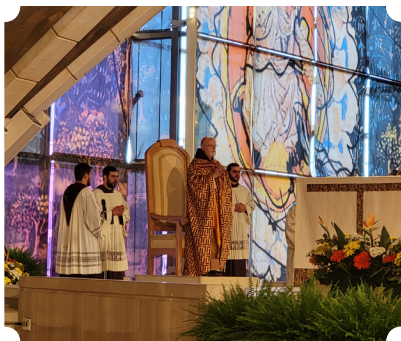
Saint Pio's Feast Day Mass in the new church in San Giovanni Rotondo