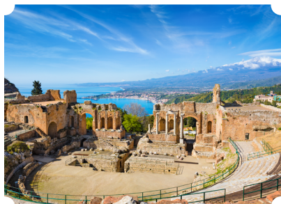
Greek Theater in Taormina