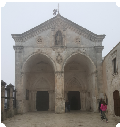
Entrance to Saint Michael's Cave