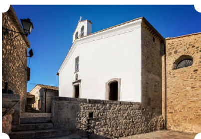
Church of Sant'Anna, where Padre Pio was baptized