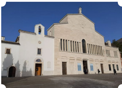
The Original church in SGR where Padre Pio celebrated Mass (left) and the Basilica of Santa Maria delle Grazie (right)