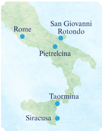
A map of your pilgrimage through Italy and Sicily