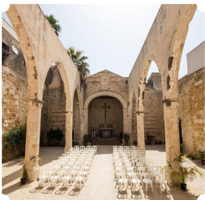
Church of Saint John the Baptist

continue our journey along Sicily's stunning Ionian Coast, making our way toward Taormina. Throughout the drive, the majestic presence of Mount Etna rises before us, an unforgettable backdrop to our entrance into Sicily.