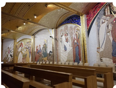
Mosaic corridor in the Church of Saint Pio of Pietrelcina