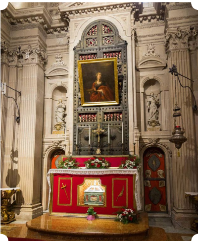
Shrine of Saint Lucy

This morning, we meet our local guide for our tour of Ortigia Island , the historic heart of Siracusa . Here we visit the Duomo di Siracusa , one of the city's most remarkable landmarks and a living record of its long history. Originally built as a Greek temple dedicated to Athena , the structure once featured a towering golden statue of the goddess. The massive Doric columns of that ancient temple remain clearly visible today, incorporated into the church walls. Above them, Norman battlements line Via Minerva, while the elegant Baroque façade was added after the devastating 1693 earthquake. Inside the Duomo, elements of the original Greek structure can still be seen, blending antiquity and faith in a single sacred space.