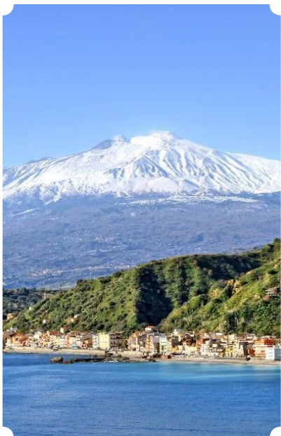
View of Mount Etna and beautiful Taormina