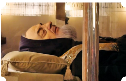
The body of Padre Pio in San Giovanni Rotondo