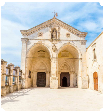
Basilica of Saint Michael the Archangel