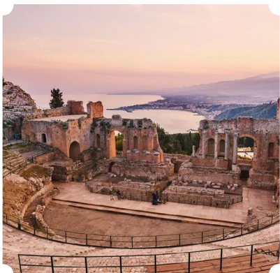
Ancient Greek theater in Taormina, Italy