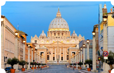
Saint Peter's Basilica