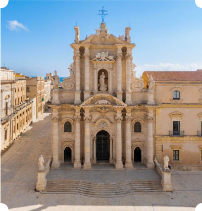
Duomo di Siracusa

This morning, we meet our local guide for our tour of Ortigia Island , the historic heart of Siracusa . Here we visit the Duomo di Siracusa , one of the city's most remarkable landmarks and a living record of its long history. Originally built as a Greek temple dedicated to Athena , the structure once featured a towering golden statue of the goddess. The massive Doric columns of that ancient temple remain clearly visible today, incorporated into the church walls. Above them, Norman battlements line Via Minerva, while the elegant Baroque façade was added after the devastating 1693 earthquake. Inside the Duomo, elements of the original Greek structure can still be seen, blending antiquity and faith in a single sacred space.